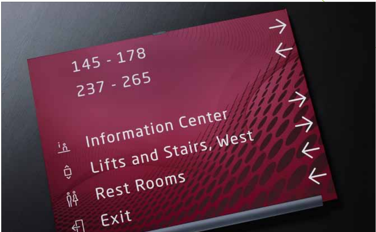
Macer Interior wall sign with print on panel