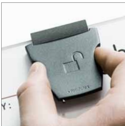
Macer Interior Paperflex locking system