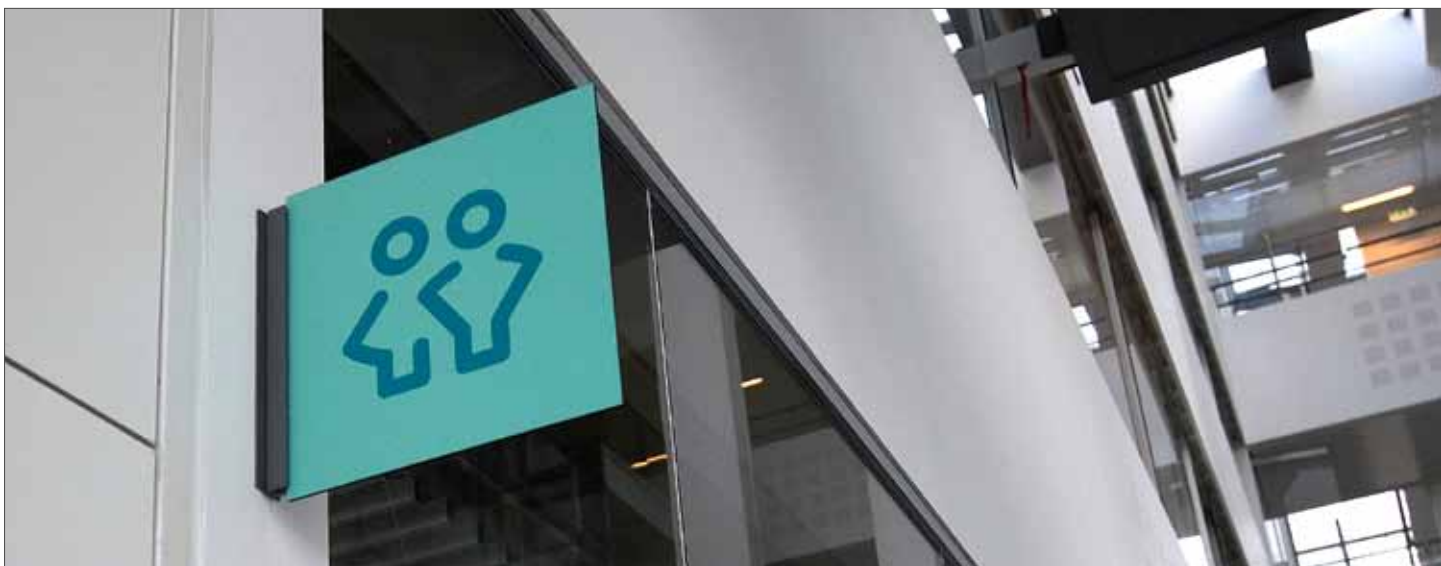
Macer Interior projected sign

Due to it's remarkable flexibility, the sign system opens the door to a host of combination options - even involving the outdoor Macer range.