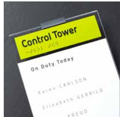
Macer Interior paperflex with tactile header