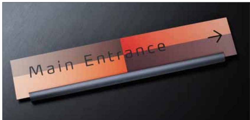
Macer Interior wall sign