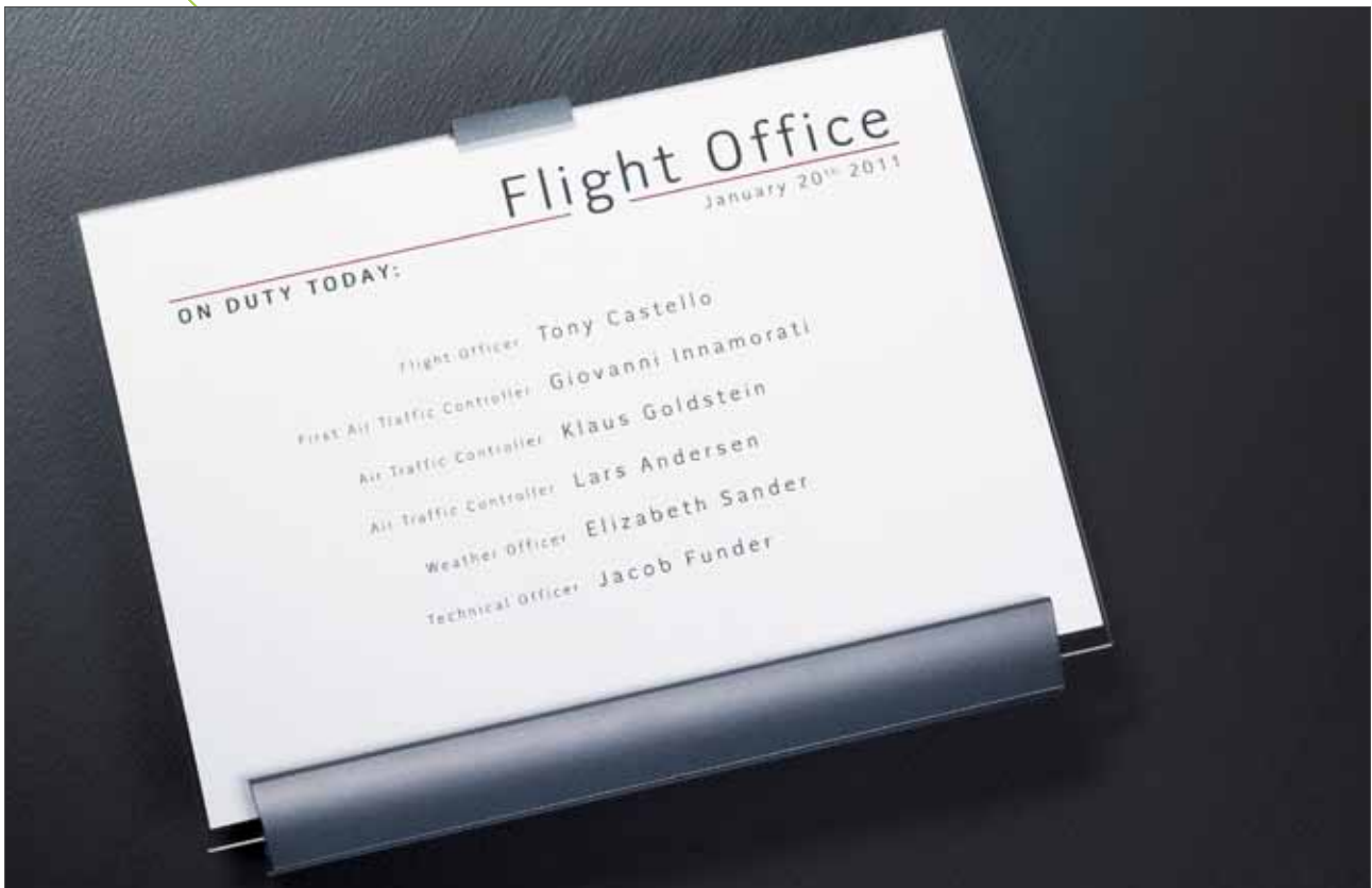
Macer Interior Paperflex