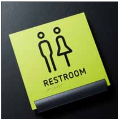
Macer Interior wall sign with tactile

On all versions, it is possible to supplement tactile information in the form of raised lettering or Braille.