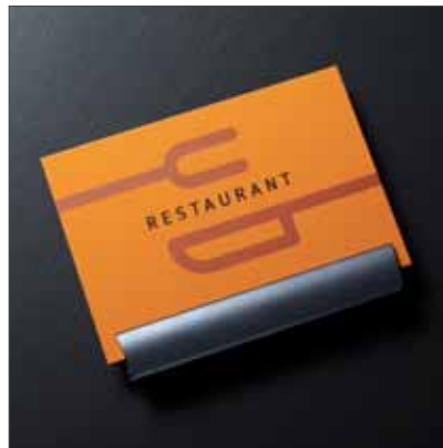
Macer Interior wall sign