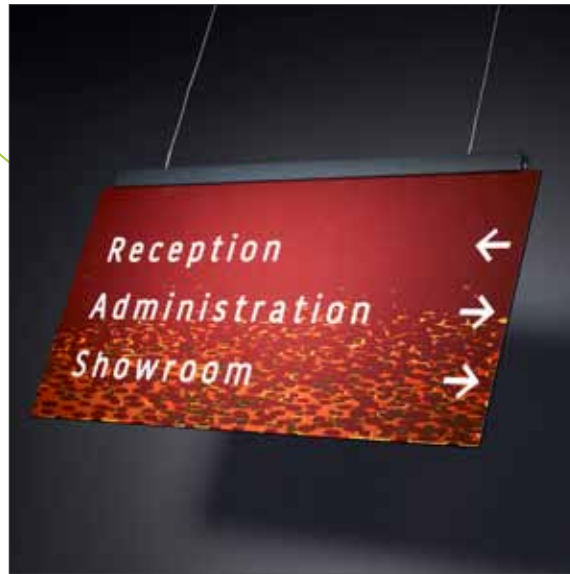
Macer Interior suspended with print on panel