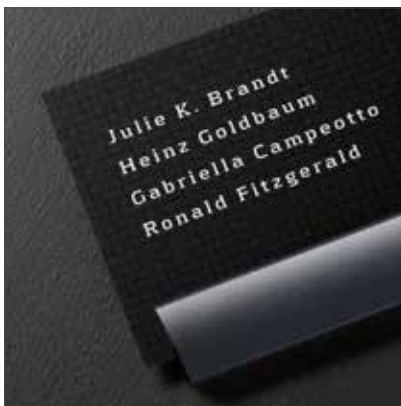
Macer Interior wall sign