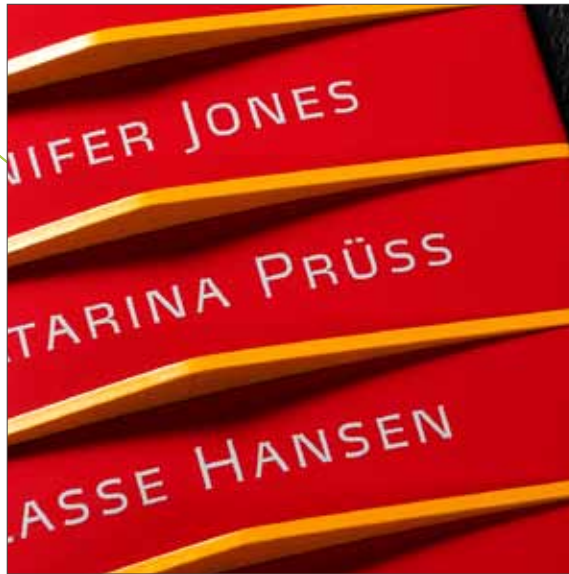
Pacific Interior Accent