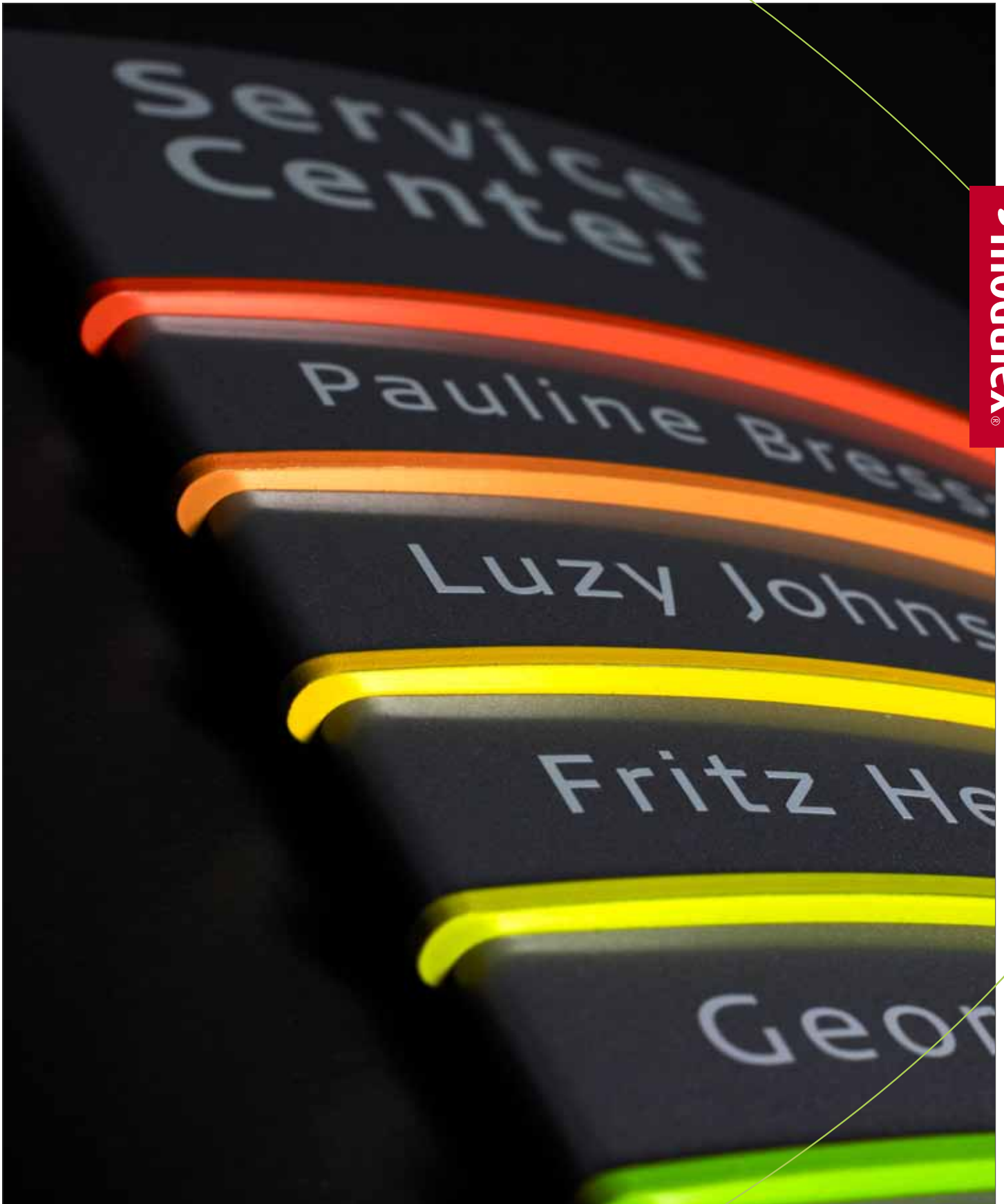
Pacific Interior Accent